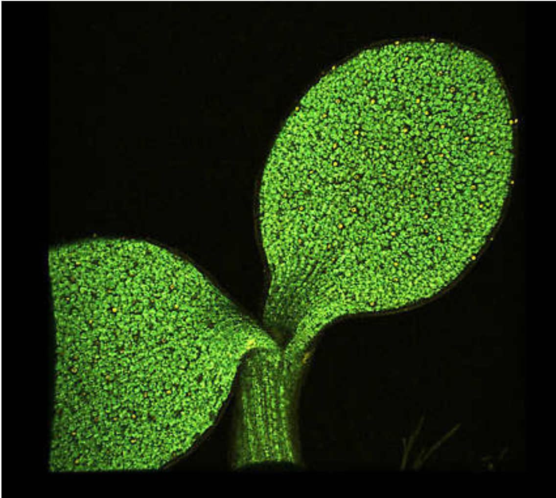
First leaves of an arabidopsis seedling.